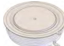
W95 Weight 825 g