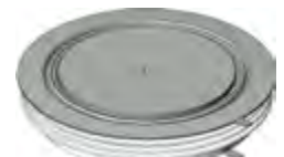
W96 Weight 1.5 kg