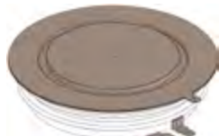
W67 Weight 650 g