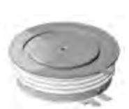
W40 Weight 430 g