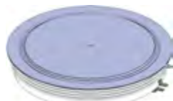
W103 Weight 3.2 kg