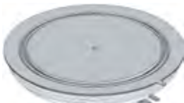
W45 Weight 2 kg