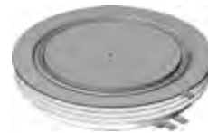
W44 Weight 1.2 kg