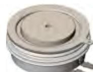
W109 Weight 360 g