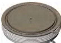
W98 Weight 1.8 kg