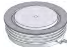
W77 Weight 550 g