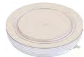
W107 Weight 1.6 kg