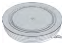
W81 Weight 1.2 kg