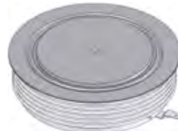
W82 Weight 1.65 kg