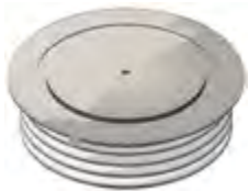
W13 Weight 1.7 kg