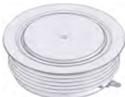
W80 Weight 1.2 kg