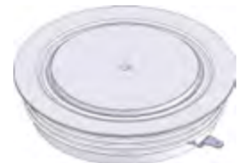
W79 Weight 890 g