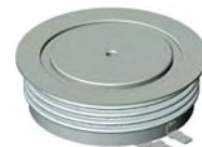
W36 Weight 500 g